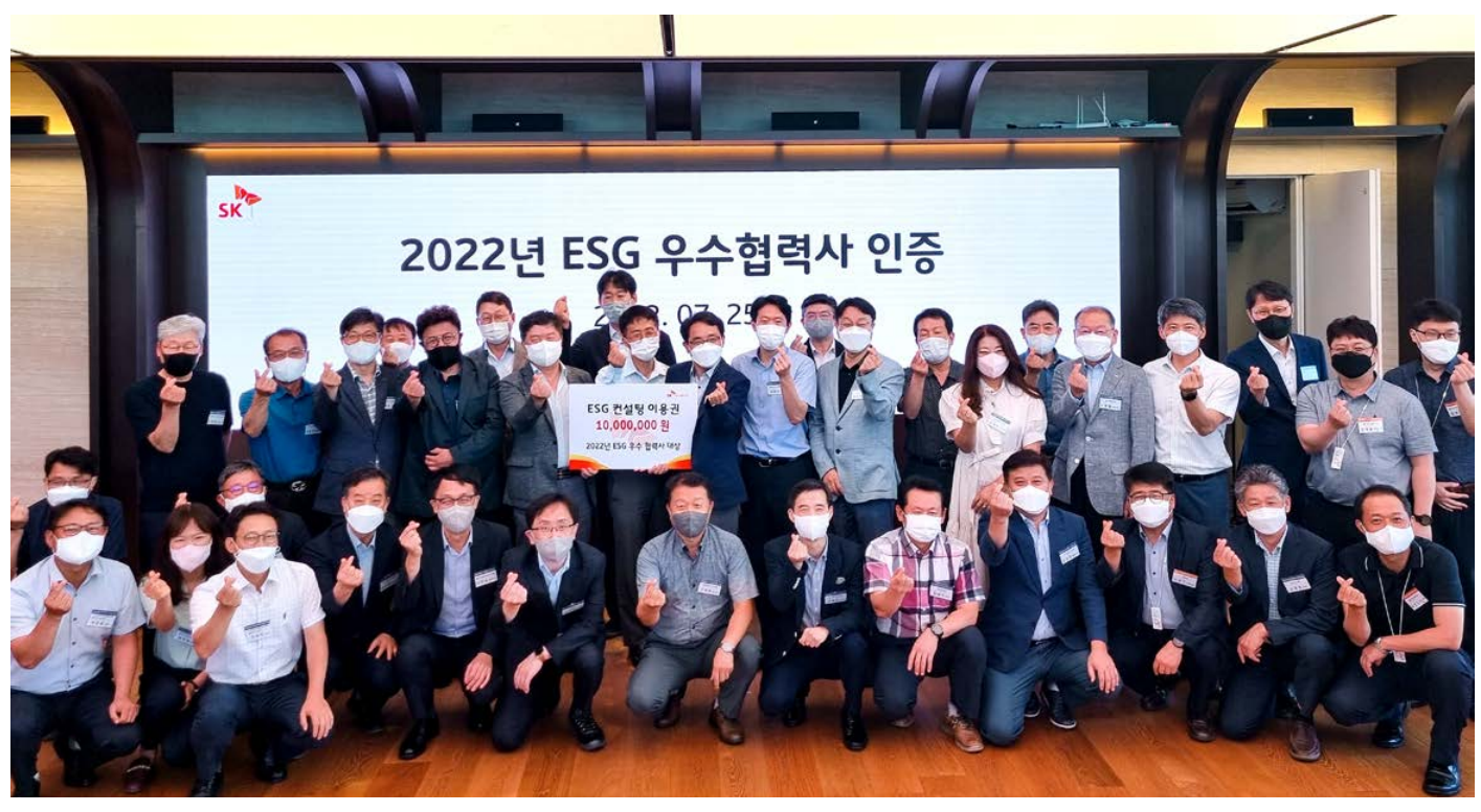
SK Innovation certifies excellent ESG suppliers in 2022.

SK Innovation certified and awarded suppliers with excellent ESG performance, based on the supplier ESG assessment in the previous year. In 2022, 25 suppliers were awarded an excellent ESG supplier certification and a voucher for ESG consulting.